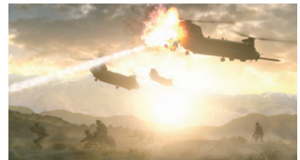
Medal of Honor.

* Savings based on USD SRP. International savings may vary.