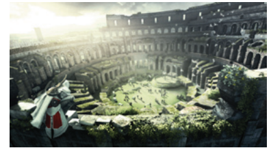
Assassin's Creed Brotherhood .

4 Cohesive Solution Autodesk Entertainment Creation Suites tools are tightly integrated through Autodesk® FBX® 2012 data exchange technology to form a cohesive, efficient pipeline solution. Single-step workflows between Maya or 3ds Max and MotionBuilder, Mudbox, and Softimage enable artists to quickly and easily transfer assets and take advantage of collaborative, iterative, cross-product workflows.