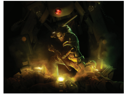
Deus Ex: Human Revolution™.

An ideal companion to Maya or 3ds Max, Softimage is a high-performance 3D application that enables artists to use intuitive, non-destructive workflows to create stunning character animation, procedural models, and effects. Softimage extends a Maya or 3ds Max pipeline with unique tools and workflows, such as the ICE (Interactive Creative Environment) platform and the Autodesk® Face Robot® toolset. With its multi-threaded GigaCore architecture, artists can use Softimage to render objects with billions of subdivision surface polygons, and manipulate extremely complex characters and scenes involving millions of polygons and thousands of animated objects.