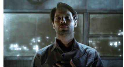
The Third Letter.