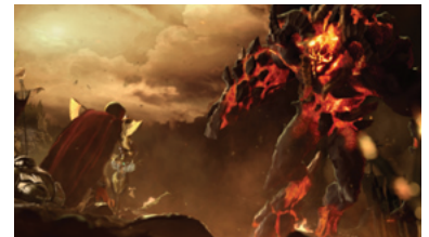
Might and Magic Heroes VI .